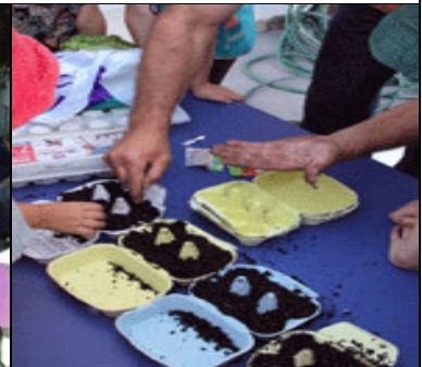
Ready to sprout