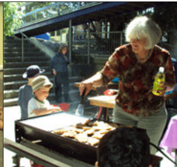
Another celebrity chef